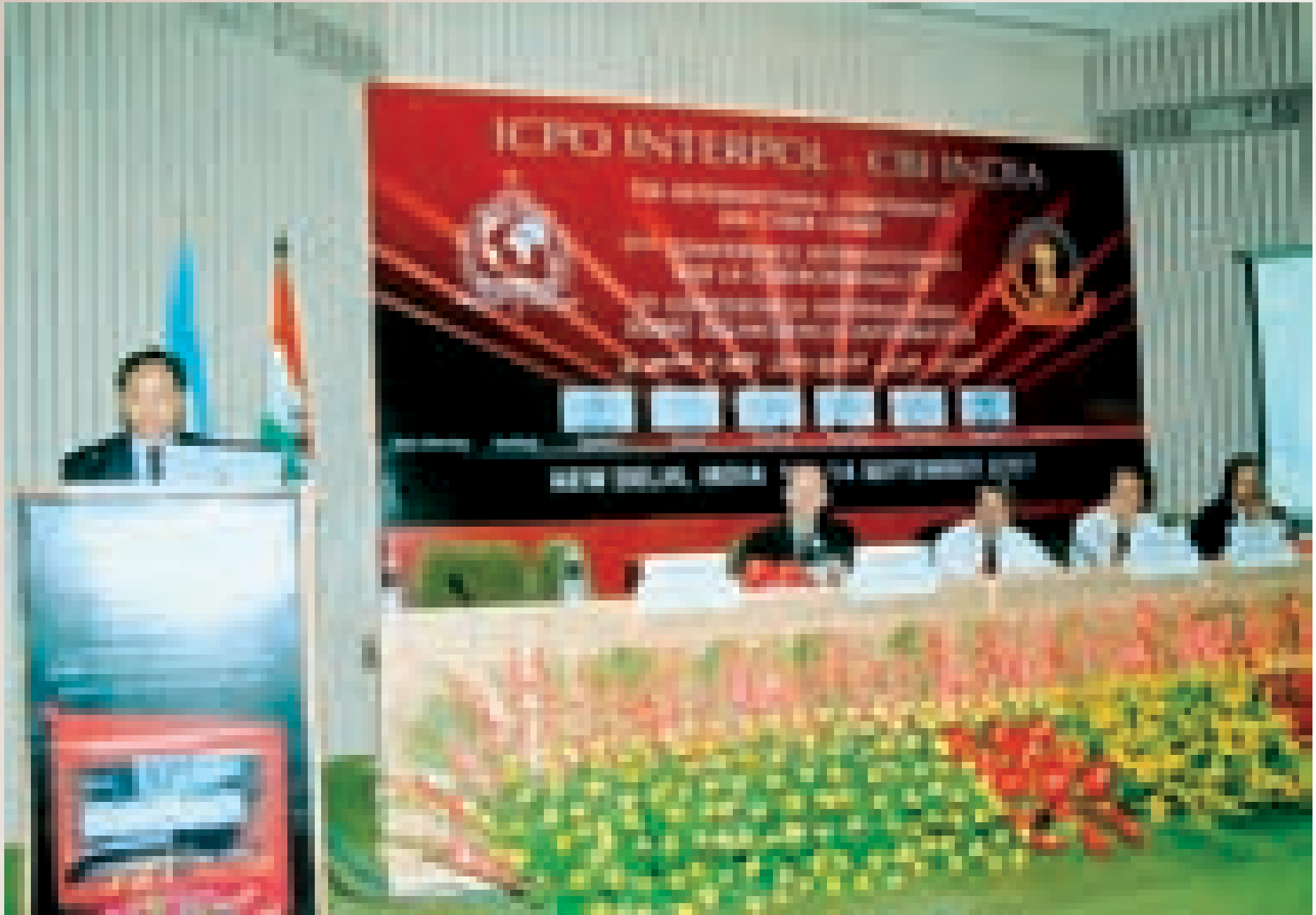
A view of the 7 th International Conference on Cyber Crime at New Delhi in 2007