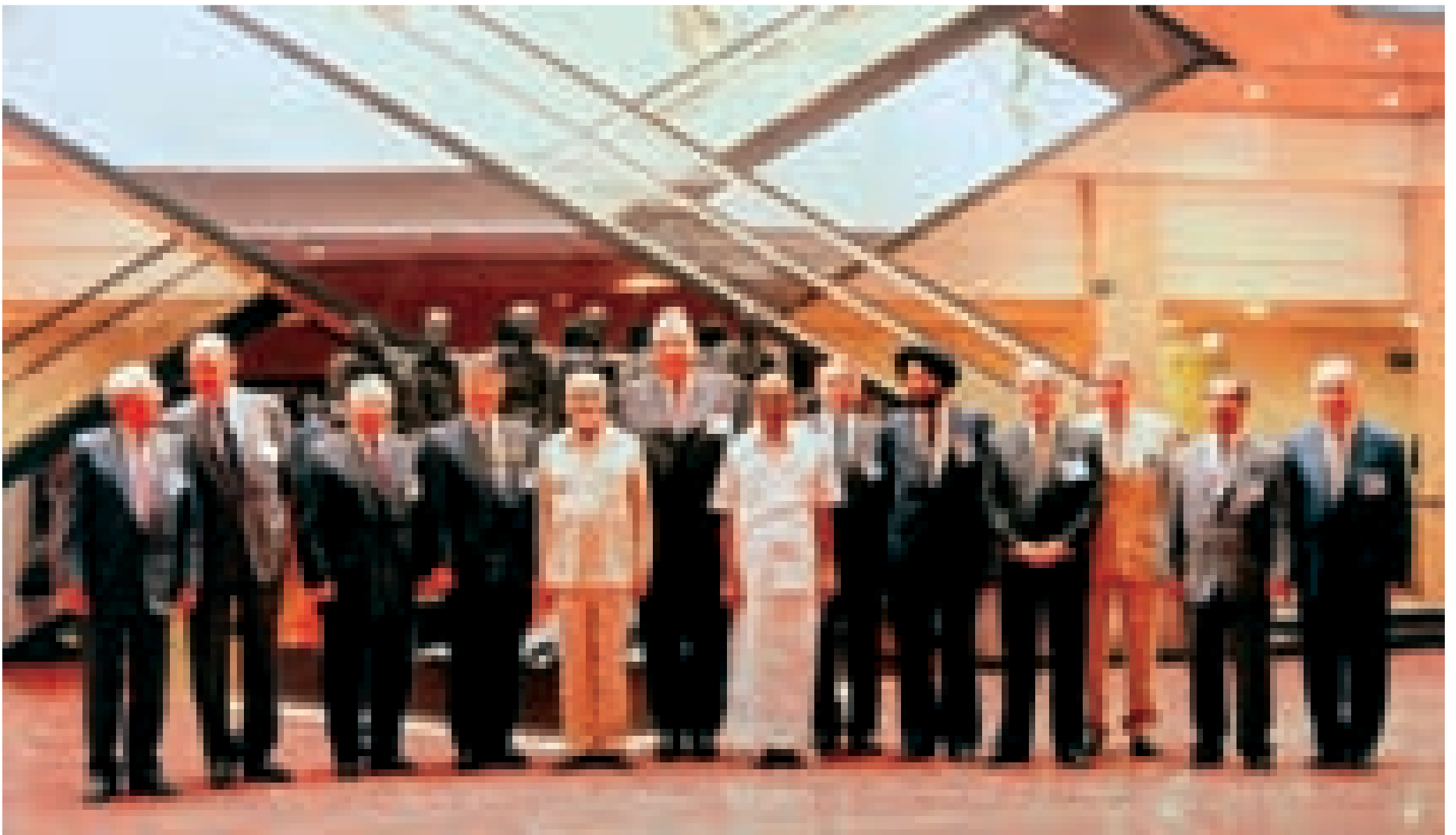
Shri I.K. Gujral, Prime Minister of India and Shri Joginder Singh, Director, CBI with the delegates of 66 th General Assembly Session of ICPO on 15 th October, 1997.