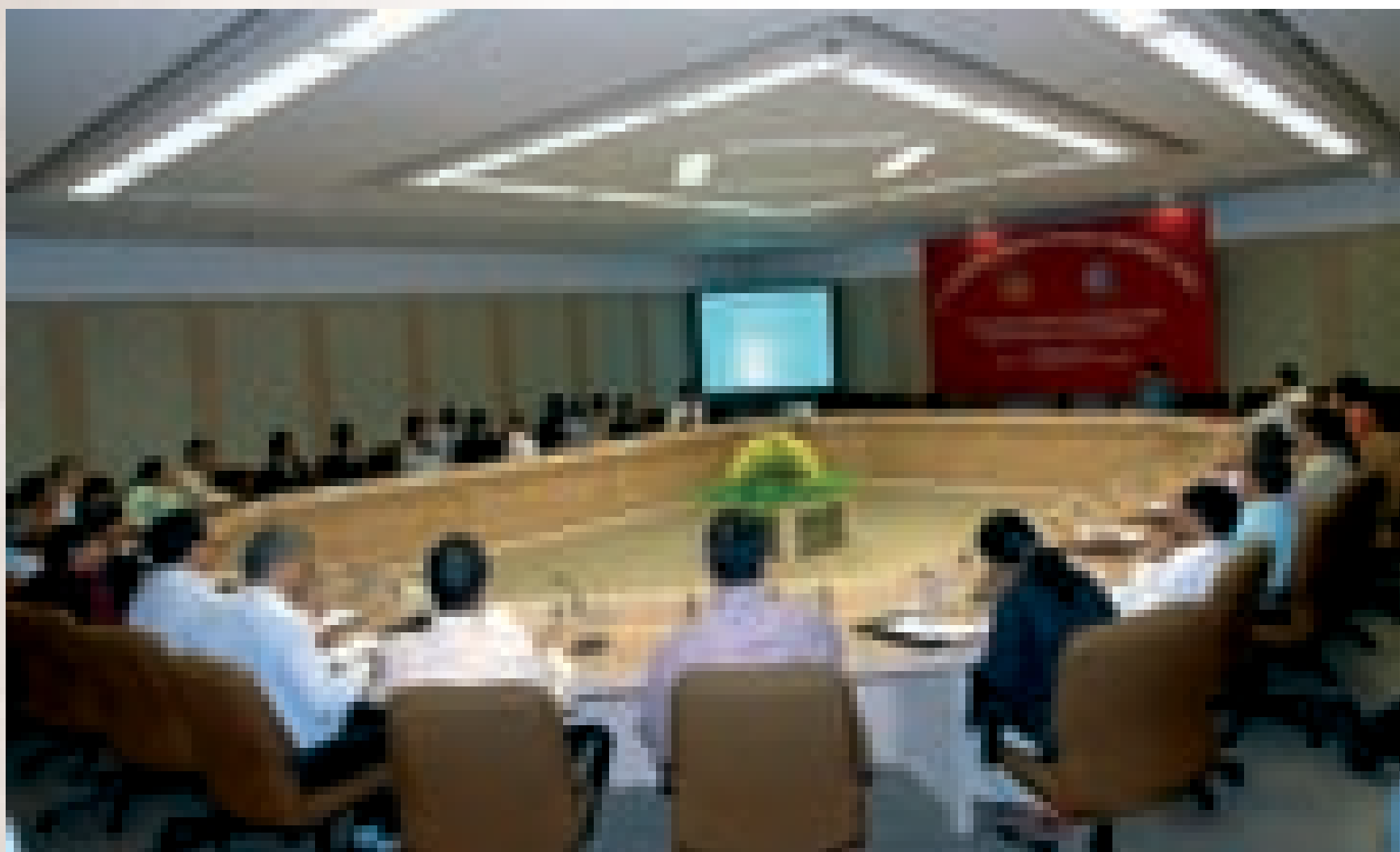
The Third INTERPOL Liaison Officers' Meeting at Vigyan Bhawan, New Delhi (2009)

A large number of requests for part-investigation, letters rotatory, extradition requests for issuance of Red Corner Notices and other notices of IPSG, including Lookout Circulars etc. are received and sent by NCB-India to various NCBs and similarly, the same request from other NCBs are also received for investigation/enquiries to be carried out in India. All the State Police Forces and other Law Enforcement Agencies in India have a link through Interpol to their counterparts in other member-countries, through Interpol Global Communication System (I-24/7) in dealing with criminal investigations.