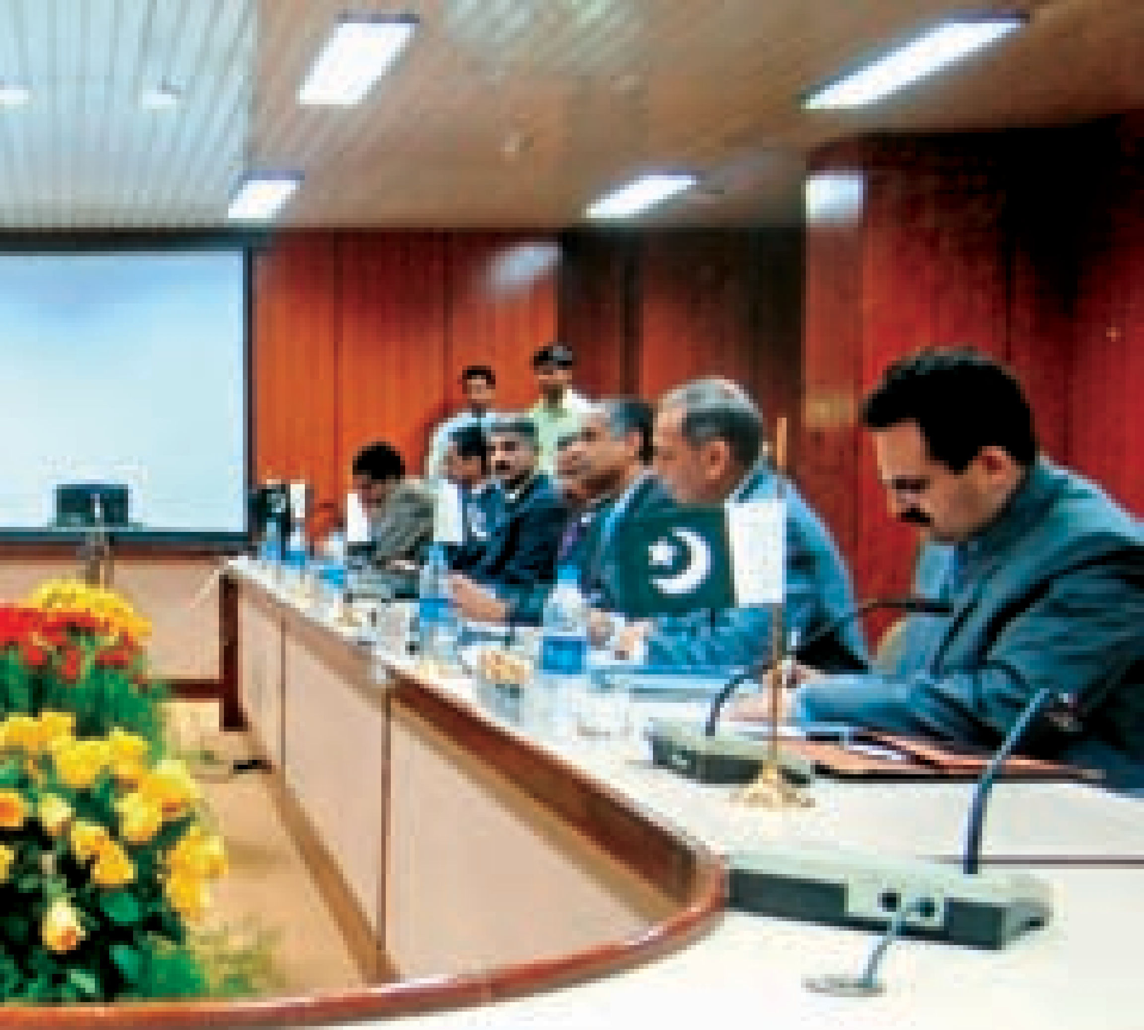
Agency of Pakistan at CBI Headquarters, New Delhi on 21 st & 22 nd March 2006