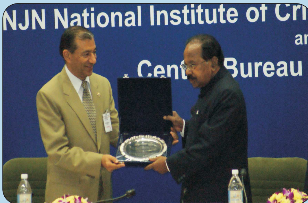
Dr. M. Veerappa Moily, being presented a memento by Director, CBI during National Seminar on "Fighting Crimes related to Corruption" on September 13, 2009