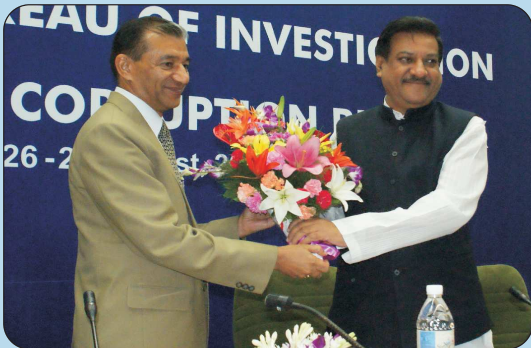
Shri Prithviraj Chavan, MoS (PMO & PP), being welcomed by Director, CBI, during XVII th Biennial Conference of CBI and Heads of State Anti-Corruption/Vigilance Bureaux-2009 at Vigyan Bhawan, New Delhi, on August 27 th , 2009