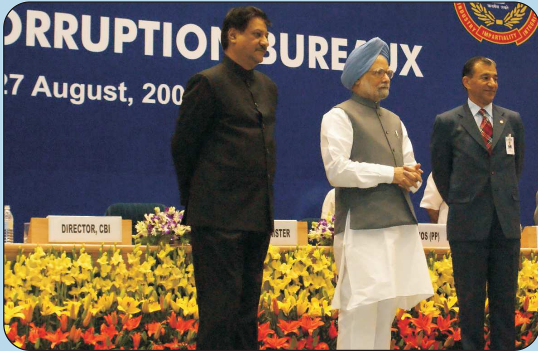
Dr. Manmohan Singh, Hon'ble Prime Minister of India, during XVII th Biennial Conference of CBI and Heads of State Anti-Corruption/Vigilance Bureaux-2009 at Vigyan Bhawan, New Delhi on August 26, 2009